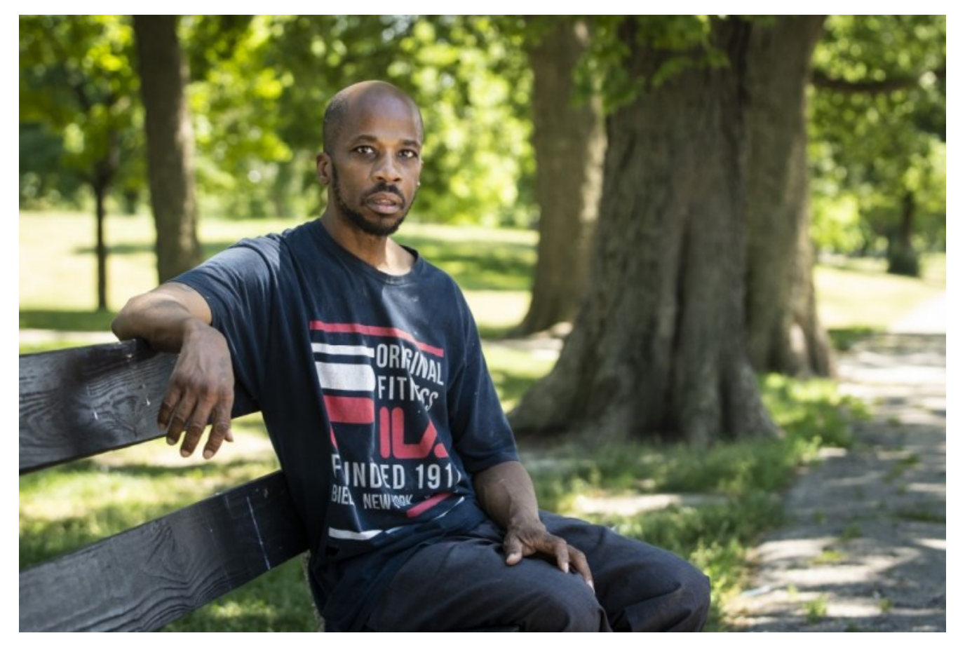
Drug issue hits every corner of Cook County. 'It breaks my heart,' the state's attorney says.